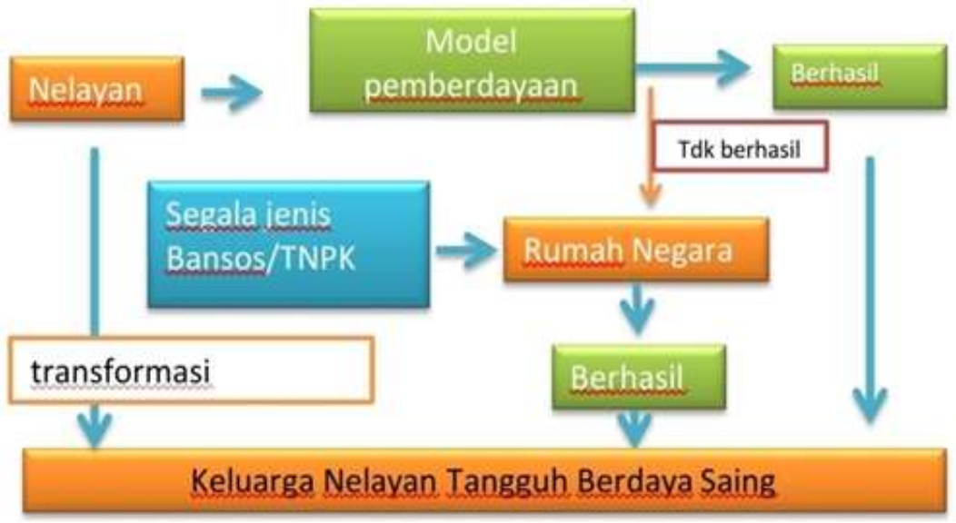
Figure 2. Overall Empowerment of Fishermen Communities Source: Field Research Results in 2021

While the fishing profession is wide open. Marine and fishery resources still accommodate thousands of workers. It depends on the work method used. There is no term no work. This situation is a solution to the employment problem called the 2025 demographic bonus, the impact of the population explosion. The world of work exists in the maritime world, marine resources and fisheries, which are managed in a systemic-ecological-holistic manner based on a strong vertical backing, strong faith and piety competing to do good. In individuals, Allah SWT has fulfilled the blessings of this world and the hereafter. Through the intention of worship because of Allah SWT, excess sustenance can be charitable, enough sustenance can be grateful, the rest is sincere because of Allah SWT, all of which will be a record of good deeds that will benefit in the hereafter. Finally, the happiness of the world and the hereafter is obtained. There is no longer a rich and poor dichotomy, everything moves for virtue and happiness, the capital exists and is complete.