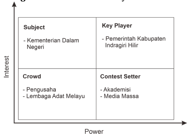
Figure 2. Stakeholder Analysis Matrix