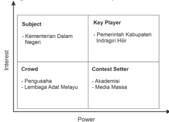
Figure 2. Stakeholder Analysis Matrix