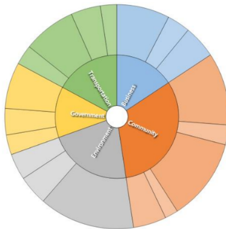
Figure 3. Factors Forming River-Based Smart Cities in Banjarmasin

The overall research results can be seen in Figure 10 below. Factors forming the river-based smart city in the city of Banjarmasin are shown visually with different portions. All factors must still be considered because each has a contribution to the realization of a river-based smart city in the city of Banjarmasin.