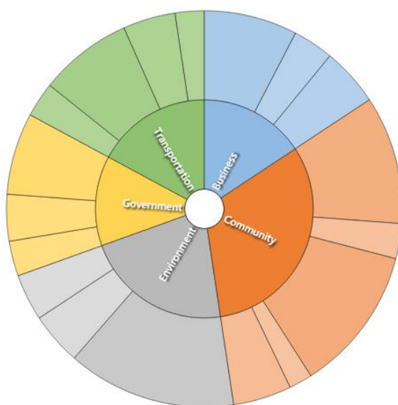
Figure 3. Factors Forming River-Based Smart Cities in Banjarmasin

The overall research results can be seen in Figure 10 below. Factors forming the river-based smart city in the city of Banjarmasin are shown visually with different portions. All factors must still be considered because each has a contribution to the realization of a river-based smart city in the city of Banjarmasin.