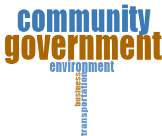
Figure 2. Words Frequency Query of Interview Result

The next step is to make nodes which are the keywords in the realization of the smart city in Banjarmasin. Nodes were determined based on the results of interviews with informants. By using the run query menu on the NVIVO 12 PLUS program, words that often appear from the interview results are obtained. In this case, five words often appear, with the results shown in Figure 2 below. The word government and community are two words that often appear or are often referred to by informants, followed by the words environment, transportation, and business. The words that often appear describe the expectations of stakeholders, namely river-based smart cities in the city of Banjarmasin are expected to be realized at the initiative of the government and the community by utilizing the river as a means of transportation and business, by paying attention to environmental sustainability.