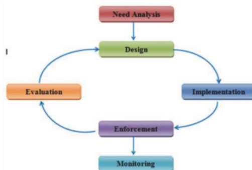
Figure 2. Governance Cycle based on KepmenPAN-RB/2011

The governance conceptually has two different dimensions, which are autonomy and capacity. Capacity and autonomy exclusively composed of resources and the degree of professionalism of the organizers of the bureaucracy, which is further away, these two things can then determine the quality of the management of which should ideally be independent. However, in reality the governance still become a difficult thing to define because it is associated with many complex things (Fukuyama 2013: 16). Meanwhile, according to Kemenpan/ RB (Ministry of Administrative Reform), the bureaucratic reform should meet the following principles: definitive, which the governance should have the boundaries, clear inputs and outputs. Sequence, in which the governance must consist of activities that in sequence accordang to space and time. Customers, where the governance should have a result. Value-added, which the governance should give the value-added to the receiver. Linkage, which the governance should be involved in the structure of an organization, and function of the cross, which the governance should include the multiple functions at once (KepmenPAN / RB No.12 2011). These principles constitute the ideal value of a governance process in a management cycle as follows: